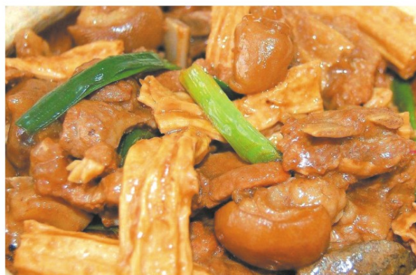
枝竹羊肉煲(無蔬菜底) $36.80 Lamb Clay Pot