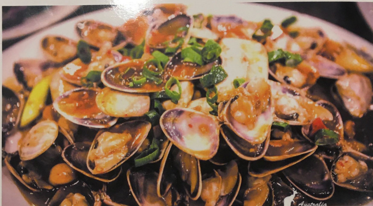
XO醬炒蜆 Pipi in XO Sauce $25.80