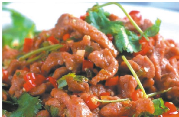
四川羊柳 $30.80 Lamb Fillet with Szechuan Style

圖片僅供參考，實物以出品為準 The picture is only for reference, please make the object as the standard.