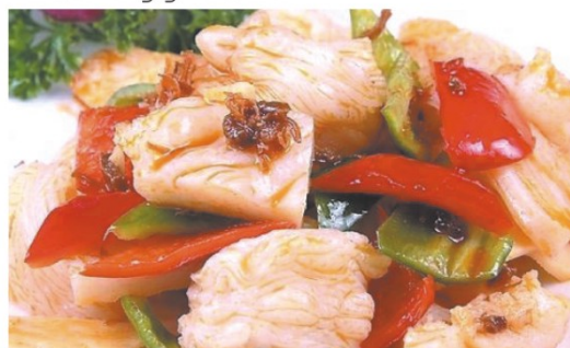
XO炒鱷魚肉 $30.80 XO Chilli Crocodile Meat

圖片僅供參考，實物以出品為準 The picture is only for reference, please make the object as the standard.