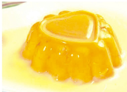
椰汁糕 $8.80 Coconut Jelly