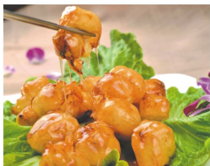
拔絲香蕉 $19.80 Toffee Banana with Ice Cream (For 2 person)