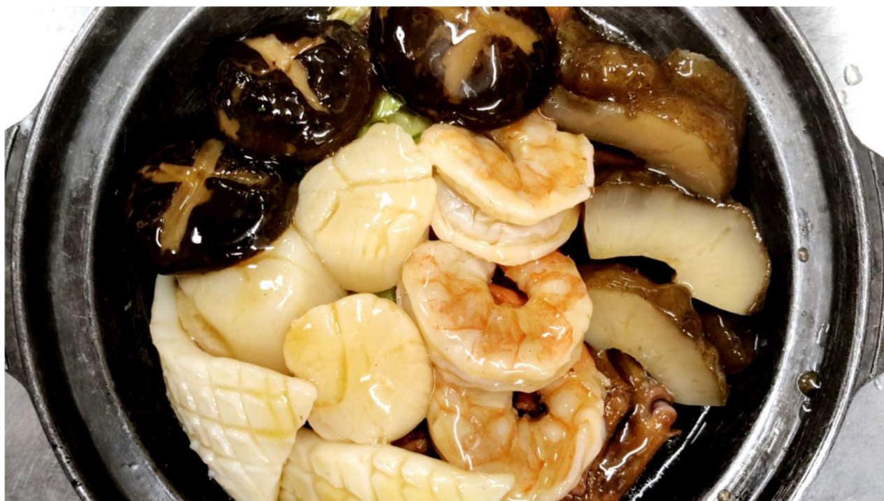
美景一品煲 Mei Jing A casserole $39.80

咖喱牛筋腩煲 $27.80 Curry Beef Bellies & Tendons