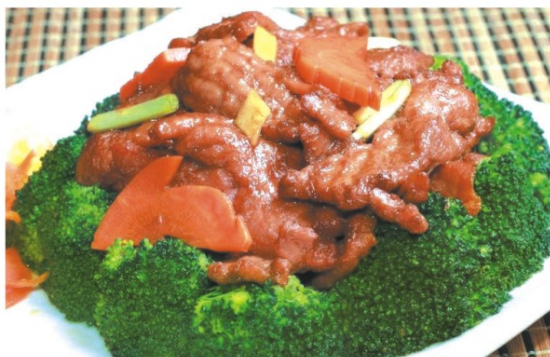
蜜椒牛柳 $31.80 Honey Pepper Fillet Steak