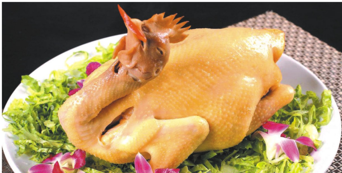
★ 貴妃走地雞半隻 Chef Free Range Chicken (Half) $25.80