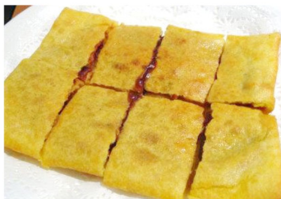
豆沙窩餅 $9.80 Red Bean Pancake