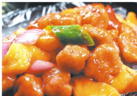
港式生炒排骨 $25.80 Hong Kong Style Pork Chop

圖片僅供參考, 實物以出品為準 The picture is only for reference, please make the object as the standard.